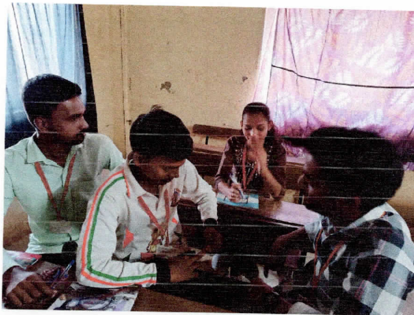
Group Discussion on IUPAC nomenclature, 28 sep 2017, time:-2 to 3pm, Mandangad college.